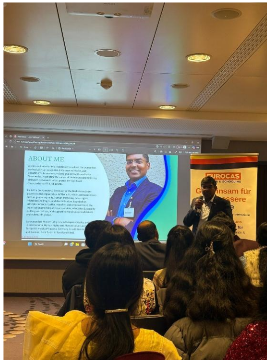
Labor rights workshop for Indian nurses, organized by EUROCAS, Frankfurt, 20 December 2025.

A capacity-building workshop on labor rights in the German health-care sector for newly arrived nurses from India was held by EUROCAS, one of Germany's leading health-care recruiters, at the Marriott Hotel in Frankfurt. AFRIW e.V. delivered an in-depth presentation on key aspects of German labor law, with particular emphasis on employment conditions, contractual obligations, workplace protections, and grievance-handling mechanisms in the health-care system. Approximately 60 Indian nurses took part, reflecting strong interest in reliable guidance as they transition into their new professional environment.