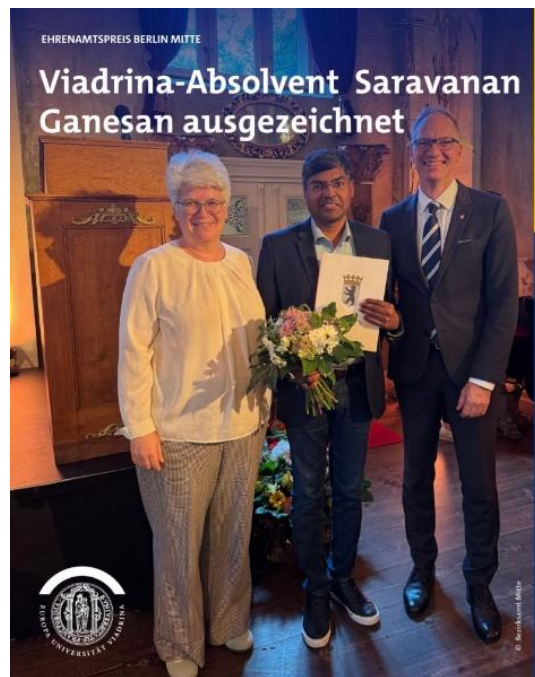
Ehrenamtspreis 2025 award ceremony, Berlin-Mitte, 3 September 2025.