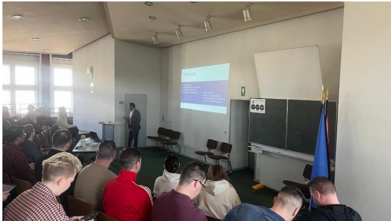
Workshop session with officials of the Landeskriminalamt (LKA) and Zoll Berlin, 18 March 2025.

indicators, abusive practices, reasons for low complaint rates, and gaps in enforcement mechanisms. The workshop emphasized the need for culturally sensitive approaches and inter-agency coordination.