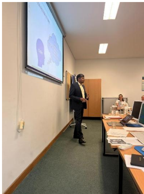
Briefing delivered to officials of the Landesamt für Einwanderung (LEA) Berlin, 18 September 2025.

AFRIW e.V. facilitated a further workshop for officials of the Landesamt für Einwanderung (LEA) Berlin, centering on the administrative challenges faced by migrants, including forged documentation, exploitative job placements, and barriers to legal recourse. Both this and the March session fostered dialogue between frontline officials and civil society, equipping institutions with practical insights to strengthen migrant protections and uphold labor rights.